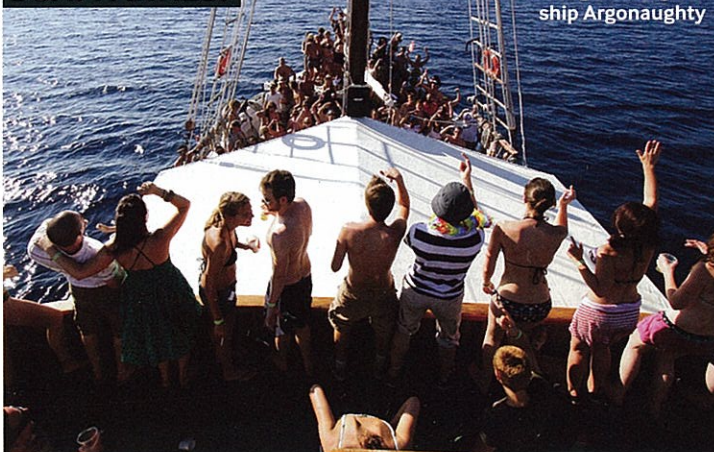
Cruising on the good ship Argonaughty