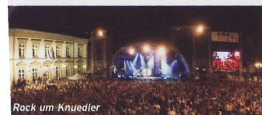
Rock um Knuedler

Acts at Me You Zik include Mokoomba, Chocquibtown and Analog Africa Soundsystem. The full Rock um Knuedler line-up has not been announced.